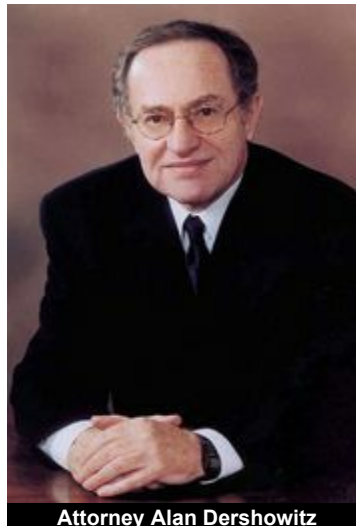
Attorney Alan Dershowitz