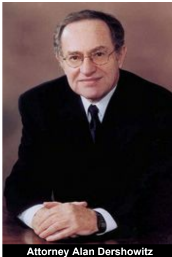
Attorney Alan Dershowitz